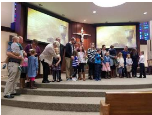
Above: Our Second Grade Students