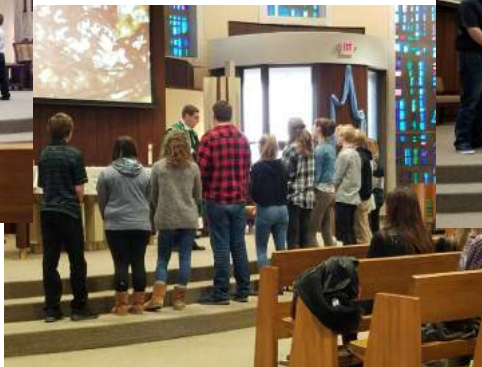
Below: Our Confirmation Students