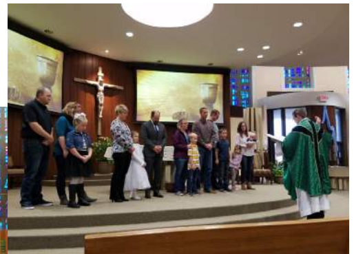
Above: Our Second Grade Students